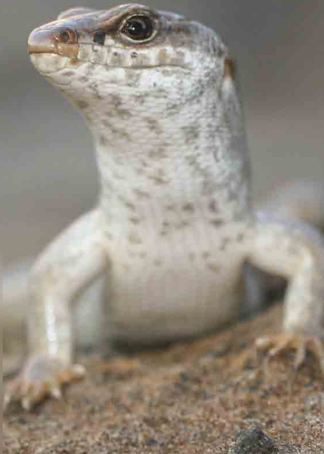
Telfair's Skink

KEY PARTNERS National Parks and Conservation Service, Forestry Service (Government of Mauritius), Mauritian Wildlife Foundation